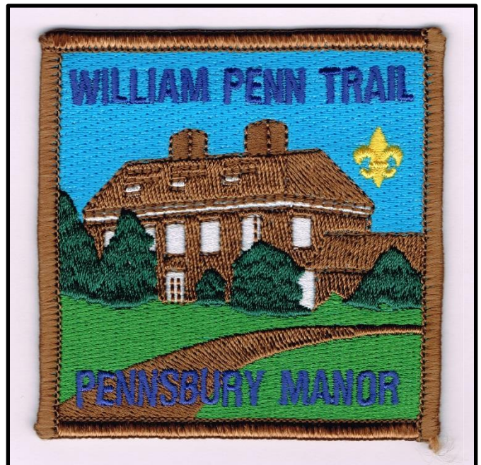
William Penn Trail Patch