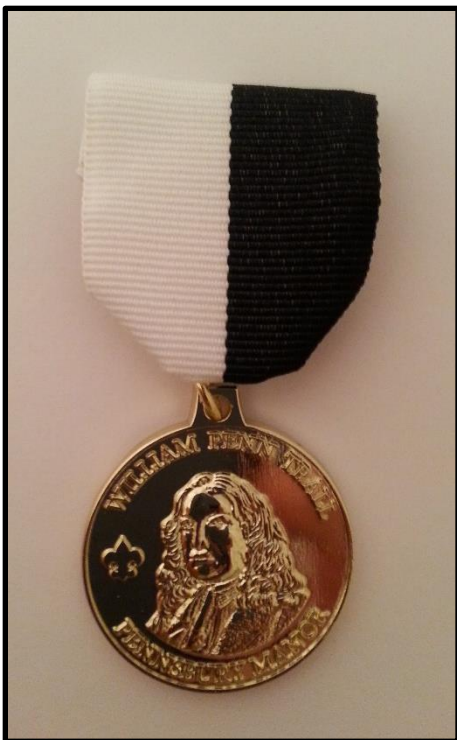
William Penn Trail Medal

The Visitor's Center exit is north of you.